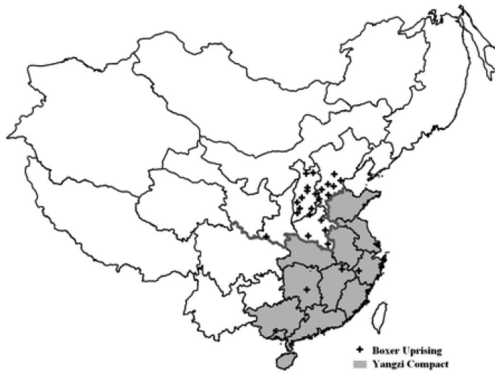
Panel A: Geography of the Boxer Uprising